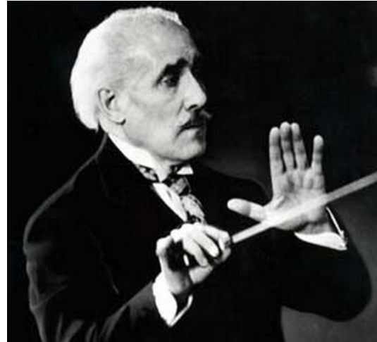
Figure 1.1 Arturo Toscanini

A cursory review of Toscanini's early musical training—largely veiled in a dearth of information—reveals that he was born with two unusual personal traits: poor eyesight and an eidetic (photographic) memory. For him, conducting from memory was less a personal decision than a necessity. He was unable to see clearly the smaller details of a score, either on the conductor's stand or piano rack. 2 His poor vision and photographic memory had far-reaching effects throughout his career and elucidate why, by age 19, he had already memorized a large number of operas, as many as 60, by some reports.