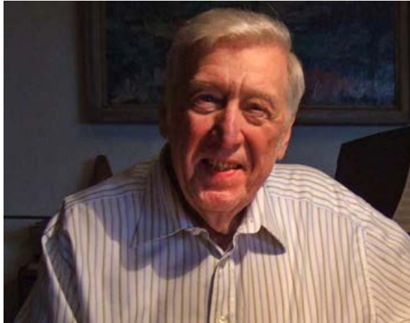
Figure 1.5 Gunther Schuller

One of Schuller’s conclusions about the feud was that neither “camp” passed critical scrutiny when exposed to historical evidence. Addressing the question of tempo flexibility, he urged all those involved to: