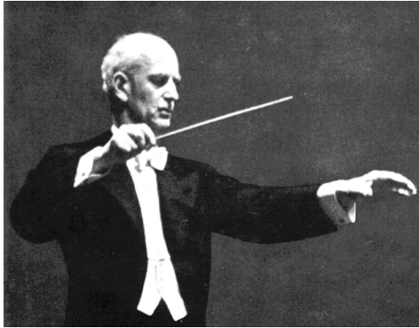
Figure 1.2 Wilhelm Furtwängler

whom he would work during his long and stellar career. 7